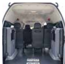
Rear Foldable Seat for Extra Luggage Storage