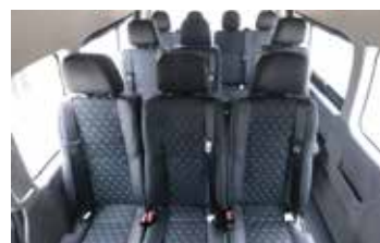
Available in 15/18 Seater