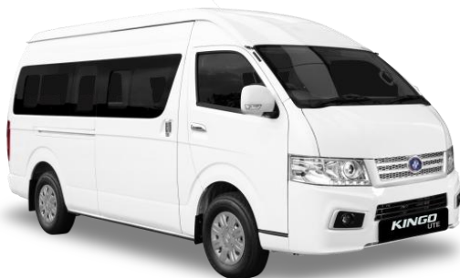
Dual Sliding Door