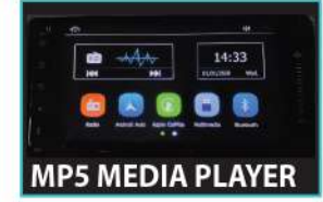
7 INCH TOUCH SCREEN SMART HEAD UNIT WITH REVERSE CAMERA