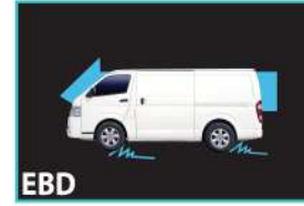
ELECTRONIC BRAKE FORCE DISTRIBUTION