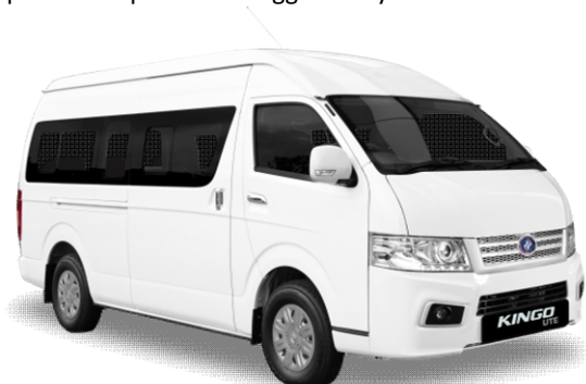
Dual Sliding Door