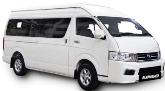
Dual Sliding Door