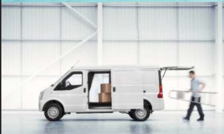
EASY ACCESS DUAL SLIDING DOOR