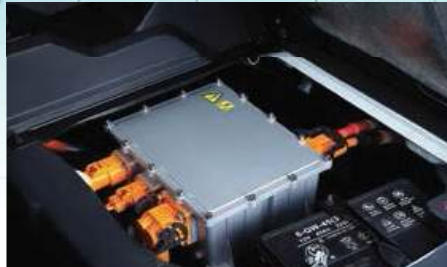
HIGH VOLTAGE LEAKING SYSTEM