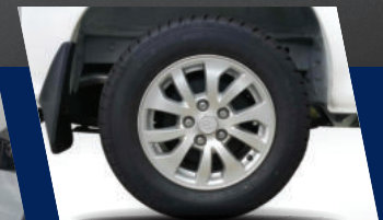
Sport Rim (Optional Accessories)