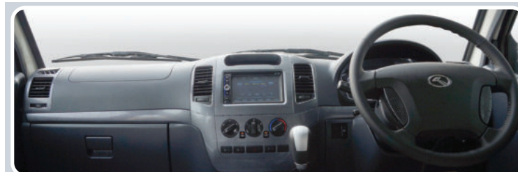
Modern Dashboard with 4-Spoke Tilt Adjustable Power Steering Wheel

Disclaimer: All features & specification shown in this brochure are subject to change without prior notice and may vary according to locality. The colour(s) of the vehicle(s) and the interior shown herein may slightly differ from actual vehicle.