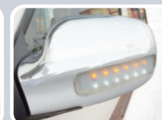
Side Mirror with Signal Lamp & Daylight