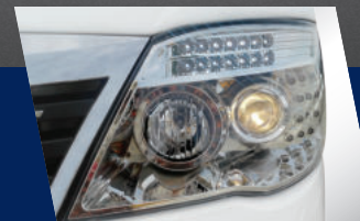
Projection Head lamp & LED Light