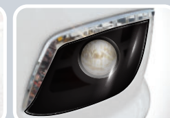
Modern Design Foglamp