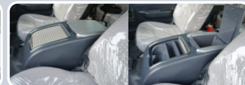
Middle Console Box