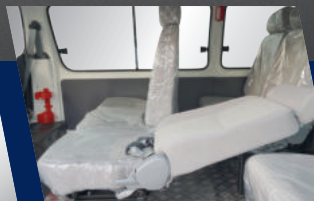
Fully Reclinable Seat Bed with Side Shift*