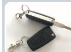
Switchblade Key with Remote Control