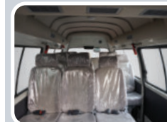
Spacious Passenger Seat