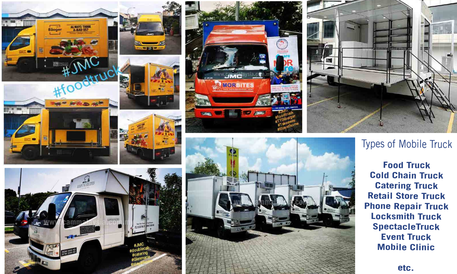
Types of Mobile Truck