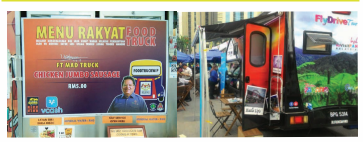
8th Feb - During the carnival, The Federal Territories Ministry expected about 1,000 food truck business licences will be issued by year's end. Its minister Datuk Seri Tengku Adnan Tengku Mansor said so far the Kuala Lumpur City Hall (DBKL) had issued 220 such licences. - http://www.kklwhariini.com

HARI WILAYAH PERSEKUTUAN 2018 / 6<sup>™</sup>- 13<sup>™</sup> FEB 2018